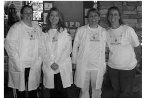
Students from the Reading Area Community College out and about working on the Drive4COPD.