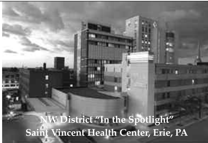
NW District "In the Spotlight" Saint Vincent Health Center, Erie, PA

NOTE: If you'd like to have your facility highlighted in an upcoming edition of the PSNews, send an email to: 2010NWDistrict@psrc.net along with your name, phone number and the name of your facility.