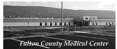
Fulton County Medical Center

We congratulate the staff of FCMC on their new facility and wish continued success to our Capital District RTs in Fulton County.